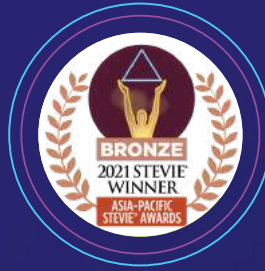
Bronze Winner Stevie Awards 2021 Most Valuable Corporate Response Most Exemplary Employer Stevie Awards 2021 Under COVID-19 Response Category