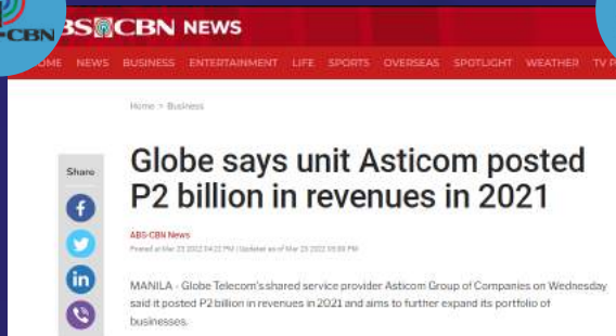
Globe says unit Asticom posted P2 billion in revenues in 2021