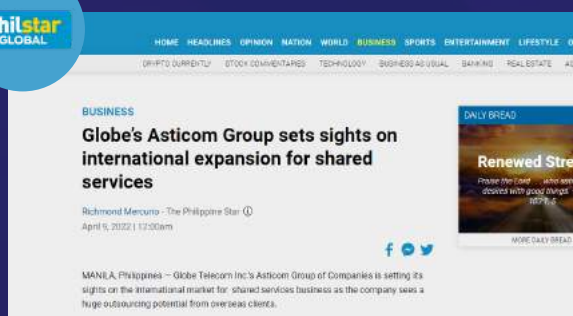
Globe's Asticom Group sets sights on international expansion for shared services