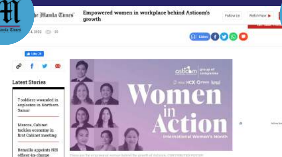
Empowered women in workplace behind Asticom's growth