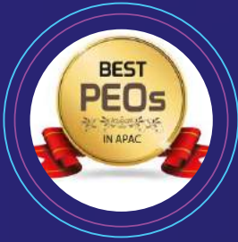
Manage HR Network Top 10 Professional Employer Organization Award in APAC